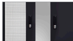
Optional Doors (Mesh/Glass/Perspex/Solid Metal)