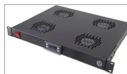
Fan Kit (Standard/Thermostat)